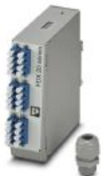
DIN rail splice box, fully mounted ready to splice, for 12x LC duplex (OS2)

Please be informed that the data shown in this PDF Document is generated from our Online Catalog. Please find the complete data in the user's documentation. Our General Terms of Use for Downloads are valid ( http://phoenixcontact.com/download )