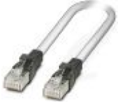
Patch cable, CAT5, assembled, 2 m

Patch cable - FL CAT5 PATCH 2,0 - 2832289