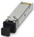
The small form-factor plug-in module provides a fiber optic interface with a data transmission speed of 100 Mbps with a wavelength of 1310 nm (long).