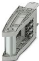
Test plug, nom. voltage: 400 V, nominal current: 20 A, color: gray

Please be informed that the data shown in this PDF Document is generated from our Online Catalog. Please find the complete data in the user's documentation. Our General Terms of Use for Downloads are valid ( http://phoenixcontact.com/download )