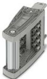
Test plug, nom. voltage: 400 V, nominal current: 20 A, color: gray

Please be informed that the data shown in this PDF Document is generated from our Online Catalog. Please find the complete data in the user's documentation. Our General Terms of Use for Downloads are valid ( http://phoenixcontact.com/download )