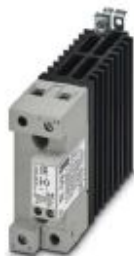
Single-phase solid-state contactor, input voltage: 230 V AC, output current: 50 A, zero voltage switch

Please be informed that the data shown in this PDF Document is generated from our Online Catalog. Please find the complete data in the user's documentation. Our General Terms of Use for Downloads are valid ( http://phoenixcontact.com/download )