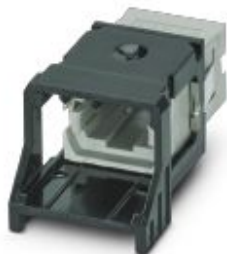
Fiber optic coupling, degree of protection: IP20, connection method: Coupling, cable outlet: straight

Please be informed that the data shown in this PDF Document is generated from our Online Catalog. Please find the complete data in the user's documentation. Our General Terms of Use for Downloads are valid ( http://phoenixcontact.com/download )