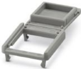
Dust protection cover

Please be informed that the data shown in this PDF Document is generated from our Online Catalog. Please find the complete data in the user's documentation. Our General Terms of Use for Downloads are valid ( http://phoenixcontact.com/download )