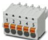
PCB connector, nominal current: 8 A, rated voltage (III/2): 160 V, nominal cross section: 1.5 mm 2 , number of positions: 5, pitch: 3.81 mm, connection method: Push-in spring connection, color: light gray, contact surface: Tin

Printed-circuit board connector - FK-MCP 1,5/ 5-ST-3,81GY35BD1-5 - 1015782