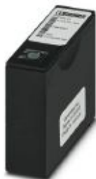
Replacement UV fluid, 23 ml, color: magenta

Please be informed that the data shown in this PDF Document is generated from our Online Catalog. Please find the complete data in the user's documentation. Our General Terms of Use for Downloads are valid ( http://phoenixcontact.com/download )