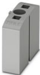
Flange, with screw-on fixing, width: 7.7 mm, height: 17.7 mm, color: gray, mounting type: Screw mounting

Please be informed that the data shown in this PDF Document is generated from our Online Catalog. Please find the complete data in the user's documentation. Our General Terms of Use for Downloads are valid ( http://phoenixcontact.com/download )