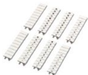
Zack marker strip, 10-section, horizontally labeled with the consecutive numbers: 11 ... 20, white, width: 5 mm

Please be informed that the data shown in this PDF Document is generated from our Online Catalog. Please find the complete data in the user's documentation. Our General Terms of Use for Downloads are valid ( http://phoenixcontact.com/download )