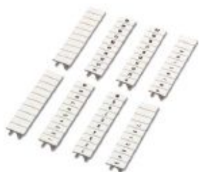
Zack marker strip, 10-section, horizontally labeled with the consecutive numbers: 81 ... 90, white, width: 5 mm

Please be informed that the data shown in this PDF Document is generated from our Online Catalog. Please find the complete data in the user's documentation. Our General Terms of Use for Downloads are valid ( http://phoenixcontact.com/download )