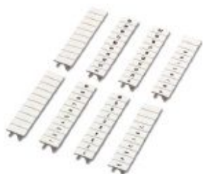
Zack marker strip, 10-section, horizontally labeled with the consecutive numbers: 151 ... 160, white, width: 5 mm

Please be informed that the data shown in this PDF Document is generated from our Online Catalog. Please find the complete data in the user's documentation. Our General Terms of Use for Downloads are valid ( http://phoenixcontact.com/download )