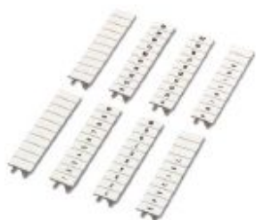
Zack marker strip, 10-section, horizontally labeled with the consecutive numbers: 281 ... 290, white, width: 5 mm

Please be informed that the data shown in this PDF Document is generated from our Online Catalog. Please find the complete data in the user's documentation. Our General Terms of Use for Downloads are valid ( http://phoenixcontact.com/download )