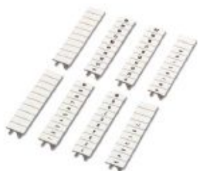
Zack marker strip, 10-section, vertically labeled with the consecutive numbers: 11 ... 20, white, width: 5 mm

Please be informed that the data shown in this PDF Document is generated from our Online Catalog. Please find the complete data in the user's documentation. Our General Terms of Use for Downloads are valid ( http://phoenixcontact.com/download )