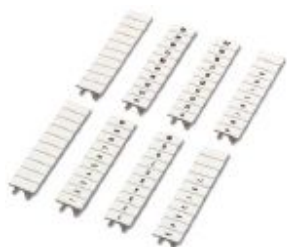
Zack marker strip, 10-section, vertically labeled with the consecutive numbers: 21 ... 30, white, width: 5 mm

Please be informed that the data shown in this PDF Document is generated from our Online Catalog. Please find the complete data in the user's documentation. Our General Terms of Use for Downloads are valid ( http://phoenixcontact.com/download )