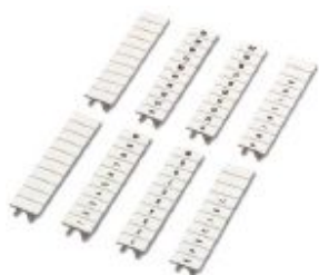
Zack marker strip, 10-section, vertically labeled with the consecutive numbers: 31 ... 40, white, width: 5 mm

Please be informed that the data shown in this PDF Document is generated from our Online Catalog. Please find the complete data in the user's documentation. Our General Terms of Use for Downloads are valid ( http://phoenixcontact.com/download )