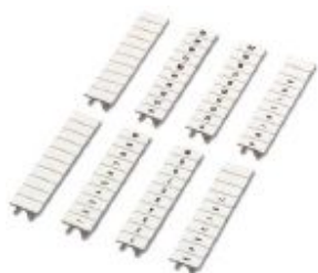
Zack marker strip, 10-section, vertically labeled with the consecutive numbers: 41 ... 50, white, width: 5 mm

Please be informed that the data shown in this PDF Document is generated from our Online Catalog. Please find the complete data in the user's documentation. Our General Terms of Use for Downloads are valid ( http://phoenixcontact.com/download )