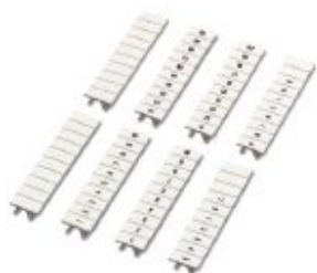
Zack marker strip, 10-section, vertically labeled with the consecutive numbers: 81 ... 90, white, width: 5 mm

Please be informed that the data shown in this PDF Document is generated from our Online Catalog. Please find the complete data in the user's documentation. Our General Terms of Use for Downloads are valid ( http://phoenixcontact.com/download )