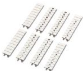
Zack marker strip, 10-section, vertically labeled with the consecutive numbers: 91 ... 100, white, width: 5 mm

Please be informed that the data shown in this PDF Document is generated from our Online Catalog. Please find the complete data in the user's documentation. Our General Terms of Use for Downloads are valid ( http://phoenixcontact.com/download )