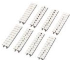
Zack marker strip, 10-section, vertically labeled with the consecutive numbers: 151 ... 160, white, width: 5 mm

Please be informed that the data shown in this PDF Document is generated from our Online Catalog. Please find the complete data in the user's documentation. Our General Terms of Use for Downloads are valid ( http://phoenixcontact.com/download )