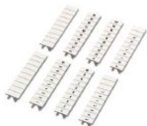
Zack marker strip, 10-section, vertically labeled with the consecutive numbers: 241 ... 250, white, width: 5 mm

Please be informed that the data shown in this PDF Document is generated from our Online Catalog. Please find the complete data in the user's documentation. Our General Terms of Use for Downloads are valid ( http://phoenixcontact.com/download )