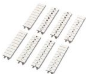
Zack marker strip, 10-section, vertically labeled with the consecutive numbers: 321 ... 330, white, width: 5 mm

Please be informed that the data shown in this PDF Document is generated from our Online Catalog. Please find the complete data in the user's documentation. Our General Terms of Use for Downloads are valid ( http://phoenixcontact.com/download )