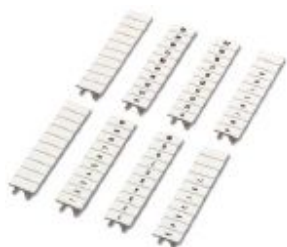
Zack marker strip, 10-section, vertically labeled with the consecutive numbers: 331 ... 340, white, width: 5 mm

Please be informed that the data shown in this PDF Document is generated from our Online Catalog. Please find the complete data in the user's documentation. Our General Terms of Use for Downloads are valid ( http://phoenixcontact.com/download )