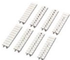
Zack marker strip, 10-section, vertically labeled with the consecutive numbers: 381 ... 390, white, width: 5 mm

Please be informed that the data shown in this PDF Document is generated from our Online Catalog. Please find the complete data in the user's documentation. Our General Terms of Use for Downloads are valid ( http://phoenixcontact.com/download )