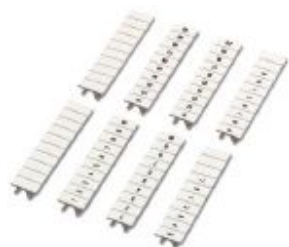
Zack marker strip, 10-section, vertically labeled with the consecutive numbers: 441 ... 450, white, width: 5 mm

Please be informed that the data shown in this PDF Document is generated from our Online Catalog. Please find the complete data in the user's documentation. Our General Terms of Use for Downloads are valid ( http://phoenixcontact.com/download )