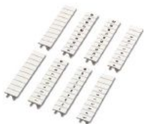
Zack marker strip, 10-section, horizontally labeled with the identical number: 3, white, width: 5 mm

Please be informed that the data shown in this PDF Document is generated from our Online Catalog. Please find the complete data in the user's documentation. Our General Terms of Use for Downloads are valid ( http://phoenixcontact.com/download )