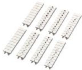
Zack marker strip, 10-section, horizontally labeled with the identical number: 9, white, width: 5 mm

Please be informed that the data shown in this PDF Document is generated from our Online Catalog. Please find the complete data in the user's documentation. Our General Terms of Use for Downloads are valid ( http://phoenixcontact.com/download )