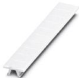
Zack marker strip, 10-section, horizontally labeled with the consecutive numbers: 81 ... 90, white, width: 6 mm

Please be informed that the data shown in this PDF Document is generated from our Online Catalog. Please find the complete data in the user's documentation. Our General Terms of Use for Downloads are valid ( http://phoenixcontact.com/download )