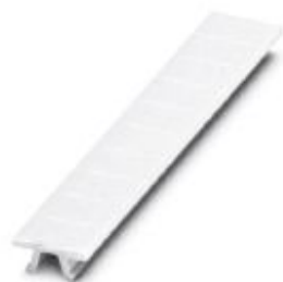
Zack marker strip, 10-section, horizontally labeled with the consecutive numbers: 151 ... 160, white, width: 6 mm

Please be informed that the data shown in this PDF Document is generated from our Online Catalog. Please find the complete data in the user's documentation. Our General Terms of Use for Downloads are valid ( http://phoenixcontact.com/download )