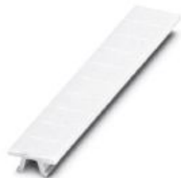
Zack marker strip, 10-section, horizontally labeled with the consecutive numbers: 161 ... 170, white, width: 6 mm

Please be informed that the data shown in this PDF Document is generated from our Online Catalog. Please find the complete data in the user's documentation. Our General Terms of Use for Downloads are valid ( http://phoenixcontact.com/download )