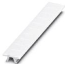
Zack marker strip, 10-section, horizontally labeled with the consecutive numbers: 211 ... 220, white, width: 6 mm

Please be informed that the data shown in this PDF Document is generated from our Online Catalog. Please find the complete data in the user's documentation. Our General Terms of Use for Downloads are valid ( http://phoenixcontact.com/download )