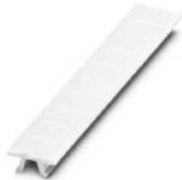
Zack marker strip, 10-section, horizontally labeled with the consecutive numbers: 221 ... 230, white, width: 6 mm

Please be informed that the data shown in this PDF Document is generated from our Online Catalog. Please find the complete data in the user's documentation. Our General Terms of Use for Downloads are valid ( http://phoenixcontact.com/download )