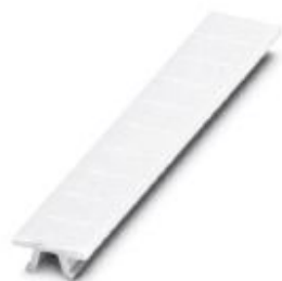
Zack marker strip, 10-section, horizontally labeled with the consecutive numbers: 281 ... 290, white, width: 6 mm

Please be informed that the data shown in this PDF Document is generated from our Online Catalog. Please find the complete data in the user's documentation. Our General Terms of Use for Downloads are valid ( http://phoenixcontact.com/download )