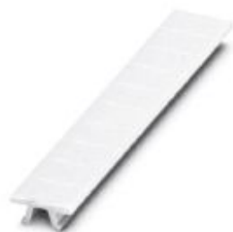
Zack marker strip, 10-section, horizontally labeled with the consecutive numbers: 301 ... 310, white, width: 6 mm

Please be informed that the data shown in this PDF Document is generated from our Online Catalog. Please find the complete data in the user's documentation. Our General Terms of Use for Downloads are valid ( http://phoenixcontact.com/download )