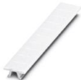
Zack marker strip, 10-section, horizontally labeled with the consecutive numbers: 311 ... 320, white, width: 6 mm

Please be informed that the data shown in this PDF Document is generated from our Online Catalog. Please find the complete data in the user's documentation. Our General Terms of Use for Downloads are valid ( http://phoenixcontact.com/download )