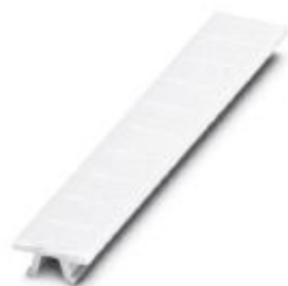
Zack marker strip, 10-section, horizontally labeled with the consecutive numbers: 321 ... 330, white, width: 6 mm

Please be informed that the data shown in this PDF Document is generated from our Online Catalog. Please find the complete data in the user's documentation. Our General Terms of Use for Downloads are valid ( http://phoenixcontact.com/download )