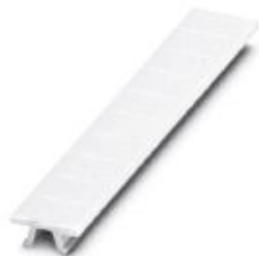
Zack marker strip, 10-section, horizontally labeled with the consecutive numbers: 331 ... 340, white, width: 6 mm

Please be informed that the data shown in this PDF Document is generated from our Online Catalog. Please find the complete data in the user's documentation. Our General Terms of Use for Downloads are valid ( http://phoenixcontact.com/download )