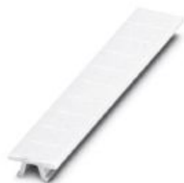
Zack marker strip, 10-section, horizontally labeled with the consecutive numbers: 351 ... 360, white, width: 6 mm

Please be informed that the data shown in this PDF Document is generated from our Online Catalog. Please find the complete data in the user's documentation. Our General Terms of Use for Downloads are valid ( http://phoenixcontact.com/download )