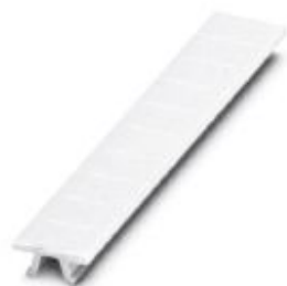
Zack marker strip, 10-section, horizontally labeled with the consecutive numbers: 441 ... 450, white, width: 6 mm

Please be informed that the data shown in this PDF Document is generated from our Online Catalog. Please find the complete data in the user's documentation. Our General Terms of Use for Downloads are valid ( http://phoenixcontact.com/download )