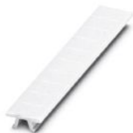
Zack marker strip, 10-section, horizontally labeled with the consecutive numbers: 461 ... 470, white, width: 6 mm

Please be informed that the data shown in this PDF Document is generated from our Online Catalog. Please find the complete data in the user's documentation. Our General Terms of Use for Downloads are valid ( http://phoenixcontact.com/download )