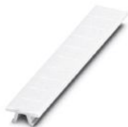
Zack marker strip, 10-section, vertically labeled with the consecutive numbers: 11 ... 20, white, width: 6 mm

Please be informed that the data shown in this PDF Document is generated from our Online Catalog. Please find the complete data in the user's documentation. Our General Terms of Use for Downloads are valid ( http://phoenixcontact.com/download )