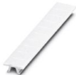
Zack marker strip, 10-section, vertically labeled with the consecutive numbers: 21 ... 30, white, width: 6 mm

Please be informed that the data shown in this PDF Document is generated from our Online Catalog. Please find the complete data in the user's documentation. Our General Terms of Use for Downloads are valid ( http://phoenixcontact.com/download )