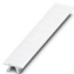
Zack marker strip, 10-section, vertically labeled with the consecutive numbers: 31 ... 40, white, width: 6 mm

Please be informed that the data shown in this PDF Document is generated from our Online Catalog. Please find the complete data in the user's documentation. Our General Terms of Use for Downloads are valid ( http://phoenixcontact.com/download )