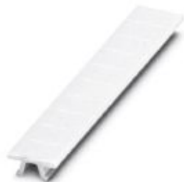
Zack marker strip, 10-section, vertically labeled with the consecutive numbers: 81 ... 90, white, width: 6 mm

Please be informed that the data shown in this PDF Document is generated from our Online Catalog. Please find the complete data in the user's documentation. Our General Terms of Use for Downloads are valid ( http://phoenixcontact.com/download )