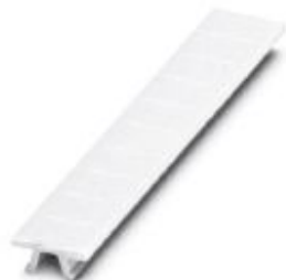
Zack marker strip, 10-section, vertically labeled with the consecutive numbers: 351 ... 360, white, width: 6 mm

Please be informed that the data shown in this PDF Document is generated from our Online Catalog. Please find the complete data in the user's documentation. Our General Terms of Use for Downloads are valid ( http://phoenixcontact.com/download )