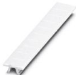
Zack marker strip, 10-section, horizontally labeled with the identical number: 17, white, width: 6 mm

Please be informed that the data shown in this PDF Document is generated from our Online Catalog. Please find the complete data in the user's documentation. Our General Terms of Use for Downloads are valid ( http://phoenixcontact.com/download )