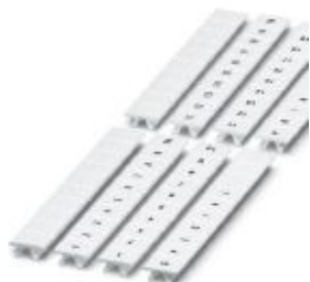
Zack marker strip, 10-section, vertically labeled with the consecutive numbers: 21 ... 30, white, width: 8 mm

Please be informed that the data shown in this PDF Document is generated from our Online Catalog. Please find the complete data in the user's documentation. Our General Terms of Use for Downloads are valid ( http://phoenixcontact.com/download )