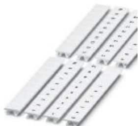
Zack marker strip, 10-section, vertically labeled with the consecutive numbers: 31 ... 40, white, width: 8 mm

Please be informed that the data shown in this PDF Document is generated from our Online Catalog. Please find the complete data in the user's documentation. Our General Terms of Use for Downloads are valid ( http://phoenixcontact.com/download )